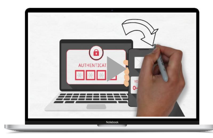
Watch our short video on Cyber Security here!

Watch our short video on Borrowing from Your Retirement Account here!